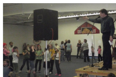
Prairie Fire String Band

Fun for the Whole Family! Bring Your Friends Too! A Wonderful Community Experience!