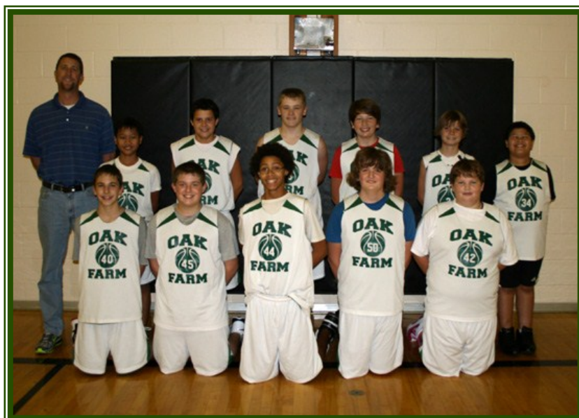
2011-2012 7th Grade Boys Basketball Team